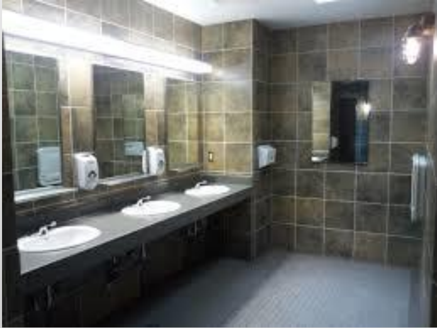
Port of Everett